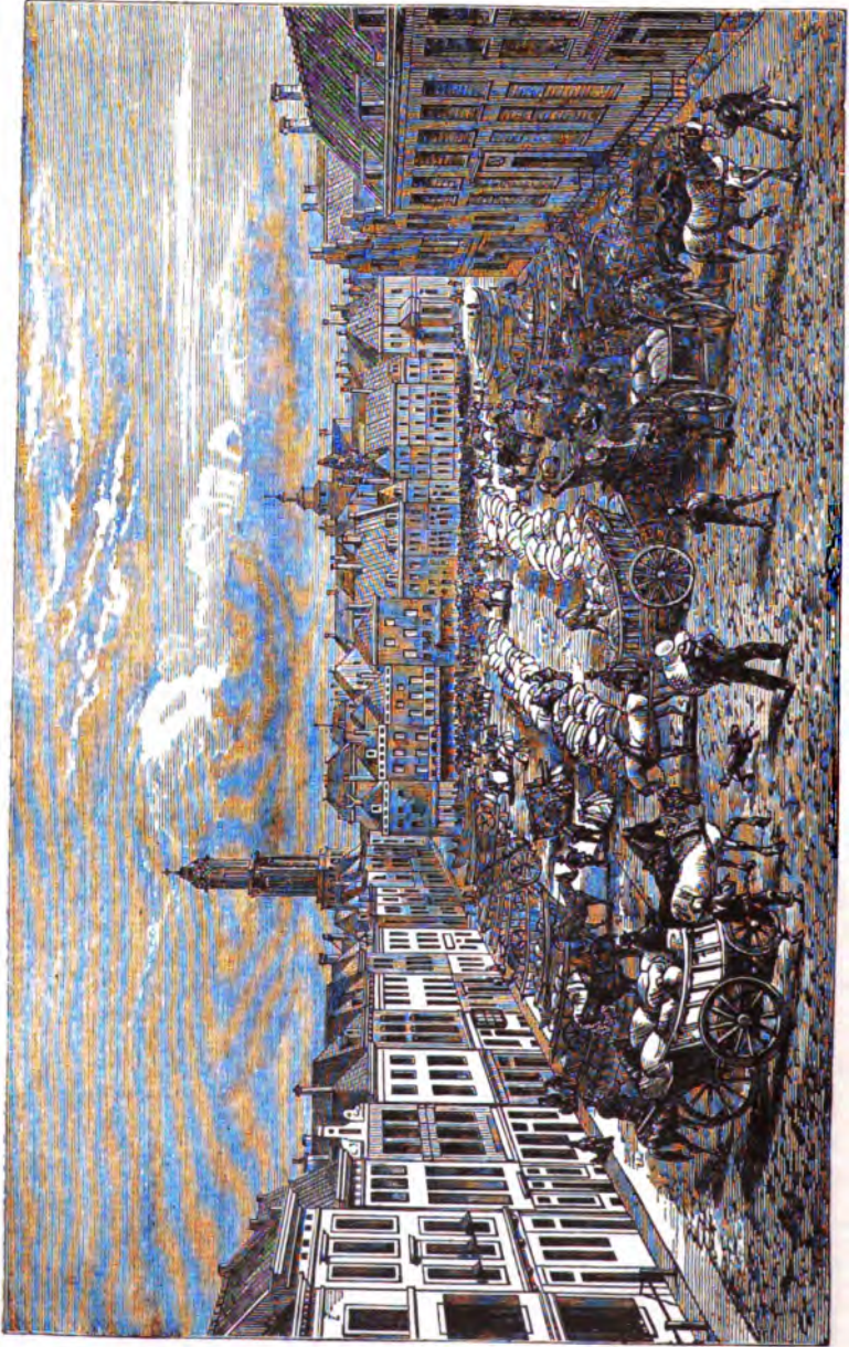
THE NEUDE SQUARE, UTRECHT.